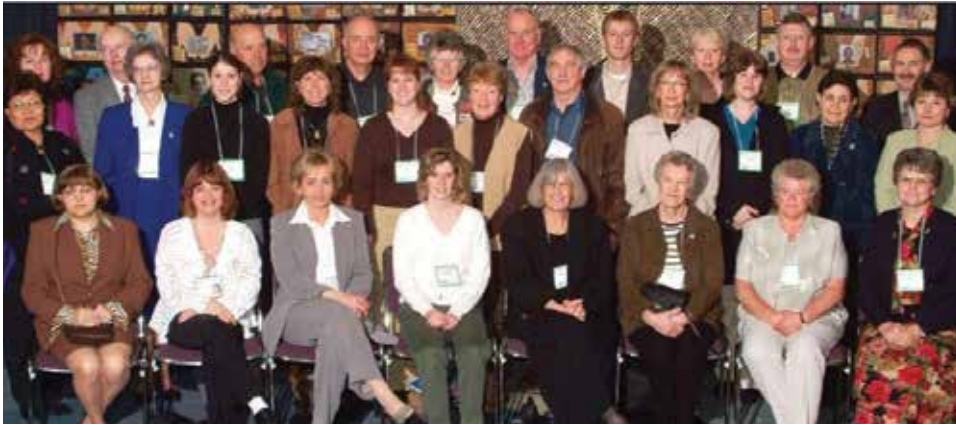
The families of the Young Worker LifeQuilt were invited to the inaugural meeting of family members of Threads of Life in May 2003. Today we provide service to more than 1400 Canadian family members

Three seconds? Really? Is it more or is it less? How long does it take to say 'STOP', let's look and see if this is a safer way to do this? Have you said 'stop' to yourself or someone else? Have you done a task at work and then wondered if there is a safer way to do it?