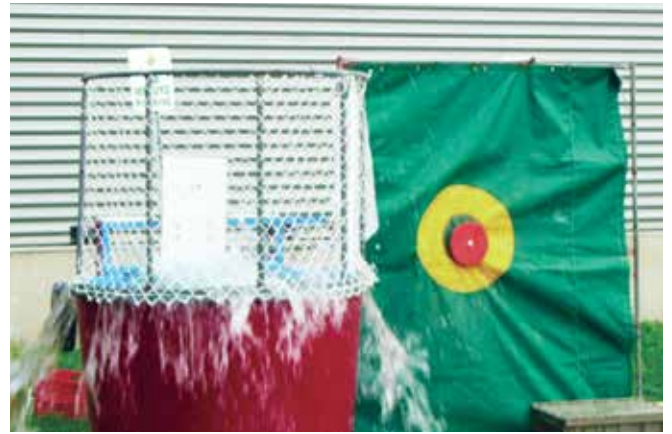
Making a splash for safety... Brrr! Staffers at Giant Tiger's Ottawa head office took the plunge during a safety awareness event and raised funds for Threads of Life.